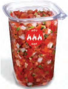
1" Circles 1000 per roll