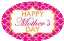
10476 - 1.25" x 2" 500 per roll