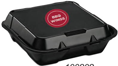
100809 1" Circle/1000 per roll