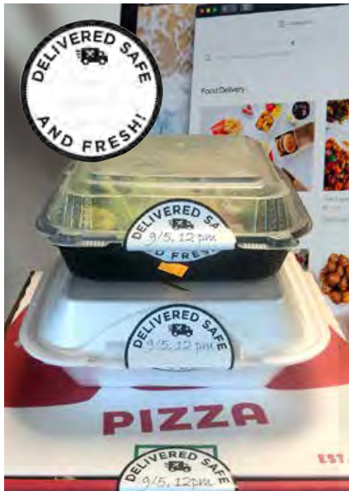
100237 3" circle / 250 per roll Adheres to most packaging.