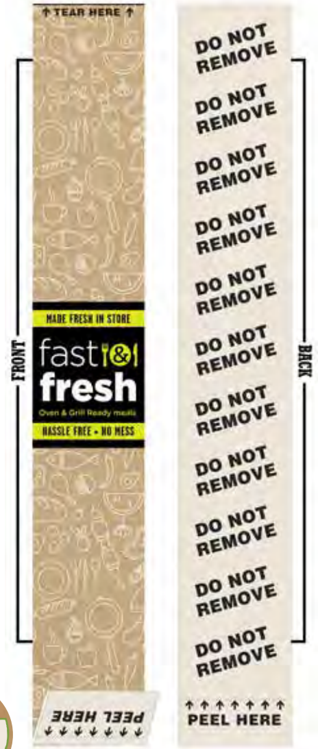
101200 - 2.5" x 16" / 250 per roll KRAFT SLEEVE Available to order as shown. Tamper resistant. Adheres to itself; not the package leaving no residue.