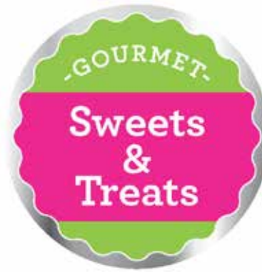
100971 2" / 500 per roll SHOWN ACTUAL SIZE