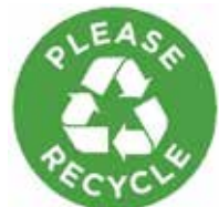
100539 1" / 1000 per roll SHOWN ACTUAL SIZE