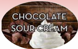
13754 1.25" x 2" / 500 per roll

Add these NEW labels to your next order.