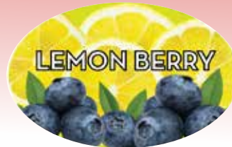
13759 1.25" x 2" / 500 per roll