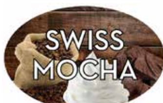
13756 1.25" x 2" / 500 per roll