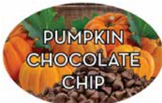
13758 1.25" x 2" / 500 per roll