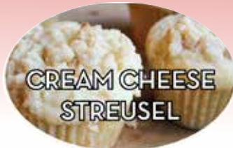
13755 1.25" x 2" / 500 per roll