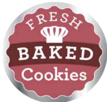
100970 2" Circle 500 per roll